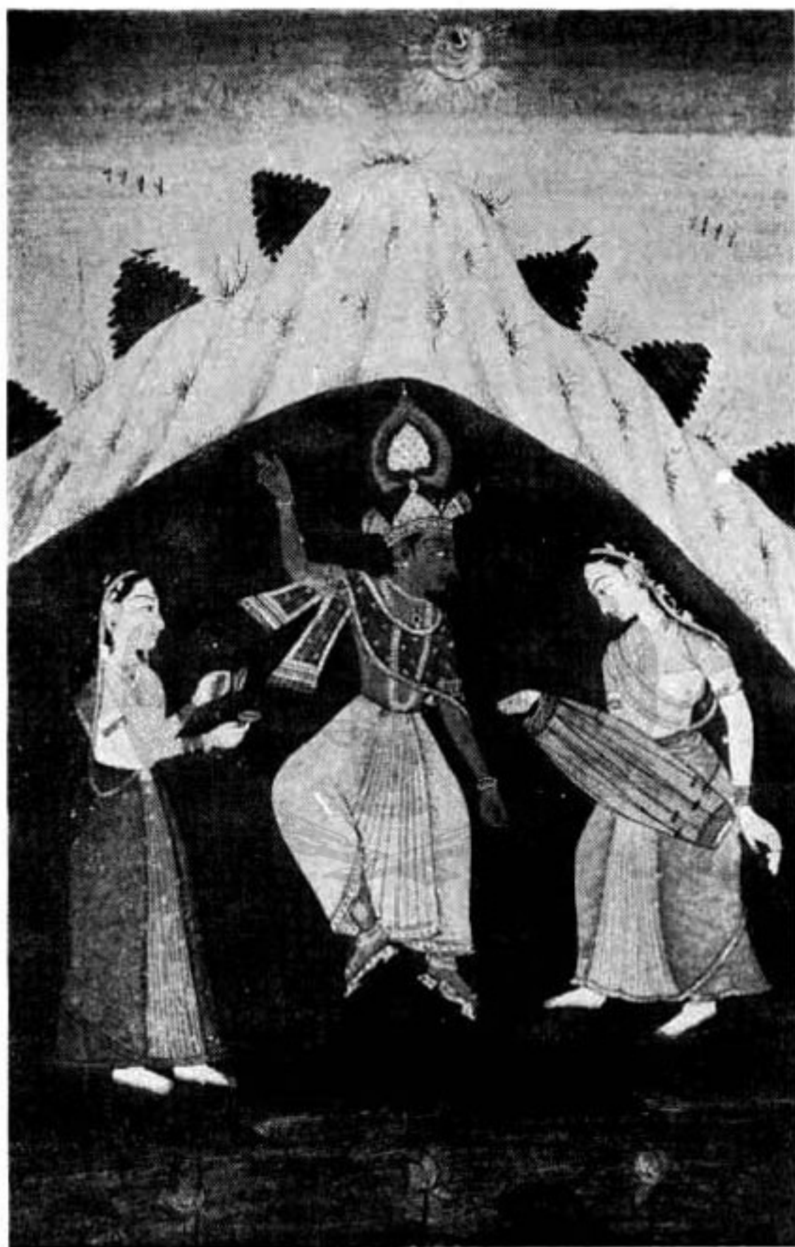
Krishna and Gopi Musicians